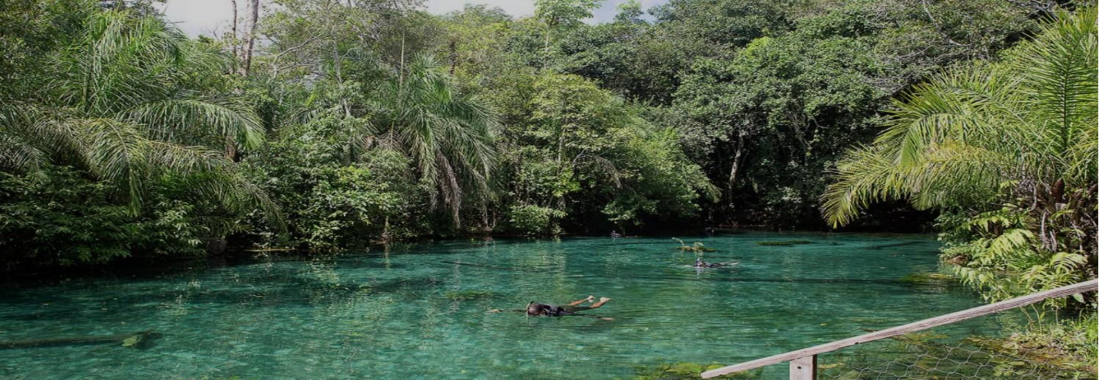
Nascente Azul (Blue Spring)

Explore the main attractions of Brazil's most famous ecotourism destination: Bonito, on this 5-day itinerary.